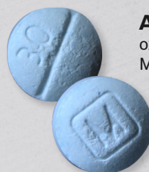
AUTHENTIC oxycodone M30 tablets