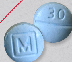
*FAKE oxycodone M30 tablets containing fentanyl

For more information about fake pills, go to DEA.gov/OnePill